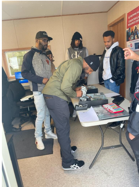
Growing Home IT-Technology Participants engage in hands-on learning to understand the ins and outs of computer technology at our Resource Center.