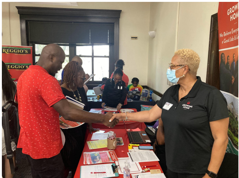
Growing Home Workforce Development staff out recruiting at various hiring and resource fairs in the community.