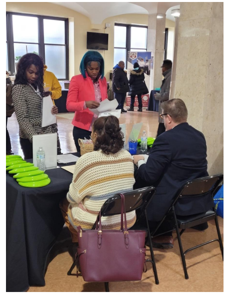
Growing Home trainees attend job fairs alongside Growing Home staff. Left is Growing Home trainees dressed professionally and ready to go for interviews! Right are two Growing Home graduates at a job fair, engaging live with employers (and dressed stylishly with Growing Home's partnership with Dress for Success!).